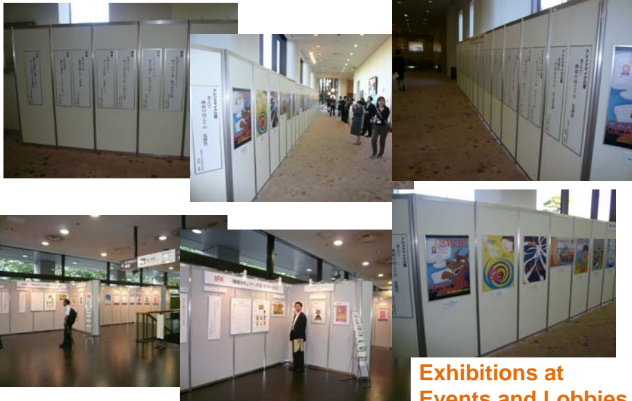
Exhibitions at Events and Lobbies