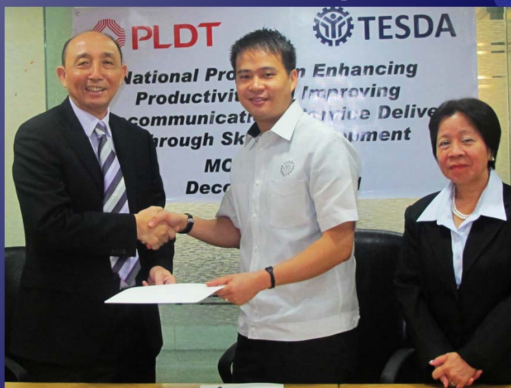
▪ PLDT (Telco)