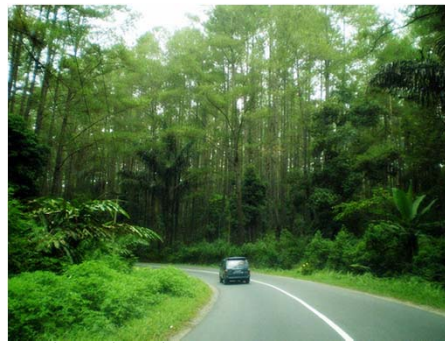
Road to Lake Toba