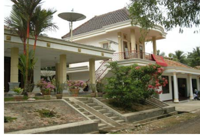
Smallholder house today