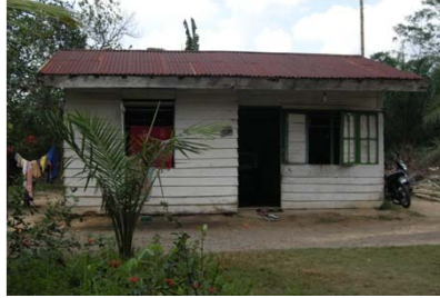
Original smallholder house