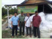
Establishing community trash bank in Manis Mata