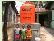
Clean water project at Desa Sentosa