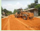
Improving local infrastructure