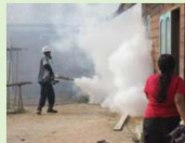
Fogging against mosquitoes in the community