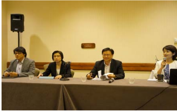
Experts from Chinese Taipei, Thailand, Singapore and Japan