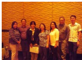
July 2014: FDA CPR/LTO Processing