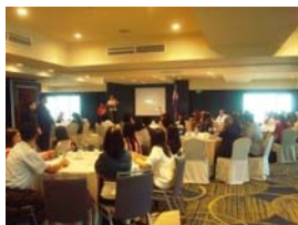
Feb 2014: PCFMI-FDA Forum