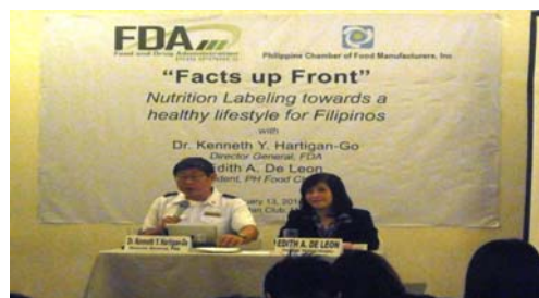
February 2014 : Joint FDA – PCFMI Media Launch on FOP GDA Labelling