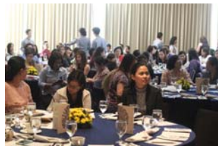
April 2015: General Membership Meeting