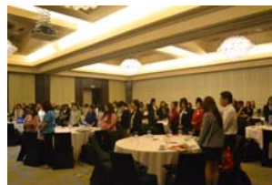
October 2014: ASEAN Harmonization Forum