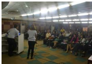
Jan 2015: PCFMI-FDA Joint Workshop