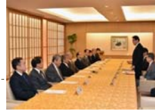
(1) Advisory Board for the Promotion of S&T Diplomacy 17 experts appointed on 16 Dec. 2015