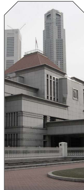
Responsive Public Service