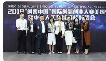
SILICON VALLEY UNITED STATES 2 NOVEMBER