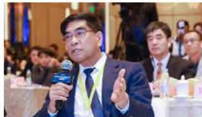
FU Chengyu Former Chairman of Sinopec Group