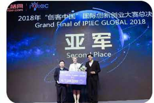
Second Place OakLabs (Germany) Drug Development Platform based on AI & Multiple Molecular Biomarkers