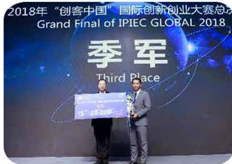
Third Place Nanopac (Malaysia) Self-Sustaining Toilet System