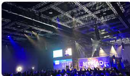
QUEENSLAND AUSTRALIA MID MAY