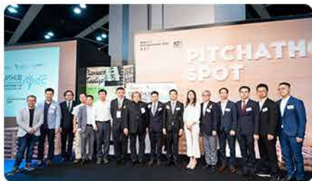
HONG KONG CHINA MAY 17