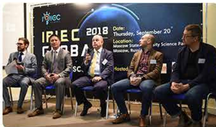
MOSCOW RUSSIA 20 SEPTEMBER