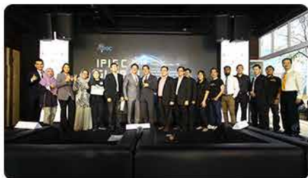
KUALA LUMPUR MALAYSIA 28 SEPTEMBER