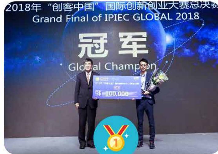
Global Champion Novus (Hong Kong, China) Nanotechnology and X-Ray Diagnostic Software System for Various Bone Surgeries