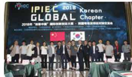
GYEONGGI-DO REPUBLIC OF KOREA 4 SEPTEMBER