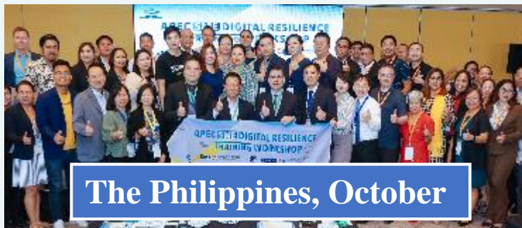
The Philippines, October

Publishing the "Guidebook on SME Digital Resilience" in difference language