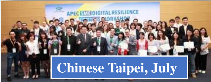
Chinese Taipei, July