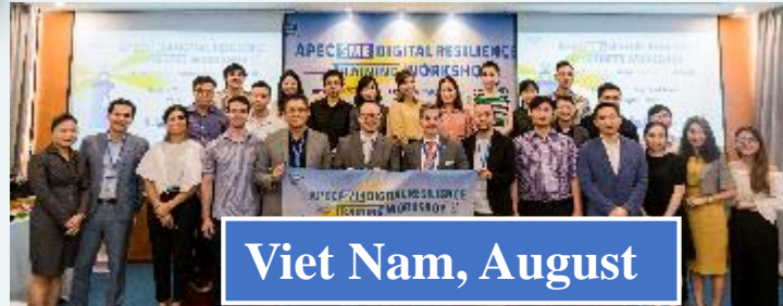
Viet Nam, August