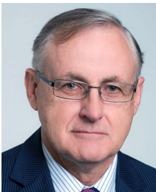
Alan Bollard Executive Director, APEC Secretariat, Singapore

Dr. Alan Bollard is the Executive Director of the APEC Secretariat based in Singapore, the body that promotes trade, investment and sustainable economic growth in the Asia-Pacific. Dr. Bollard advances APEC's agenda by executing APEC's work programmes as mandated by Leaders and Ministers.