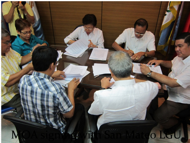
MOA signing with San Mateo LGU