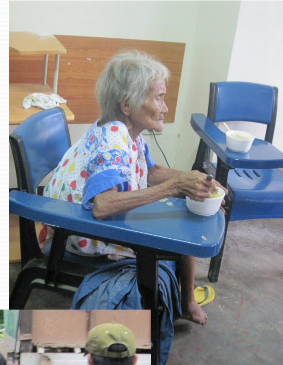
San Mateo, Rizal

saving lives resulting to zero casualty during times of disaster.