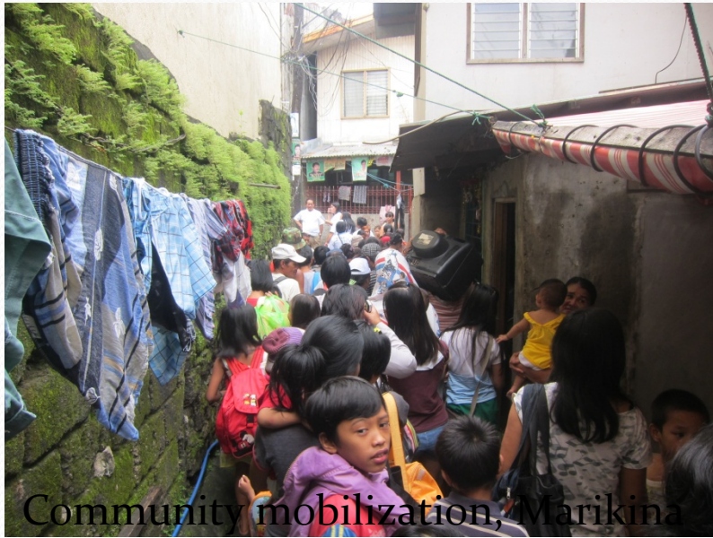
Community mobilization, Marikina