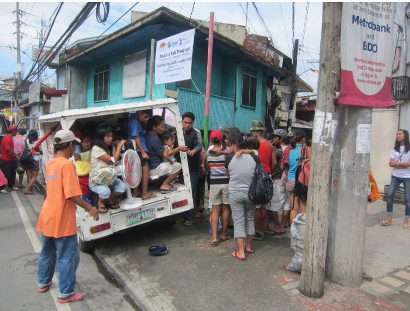
Malanday, Marikina City