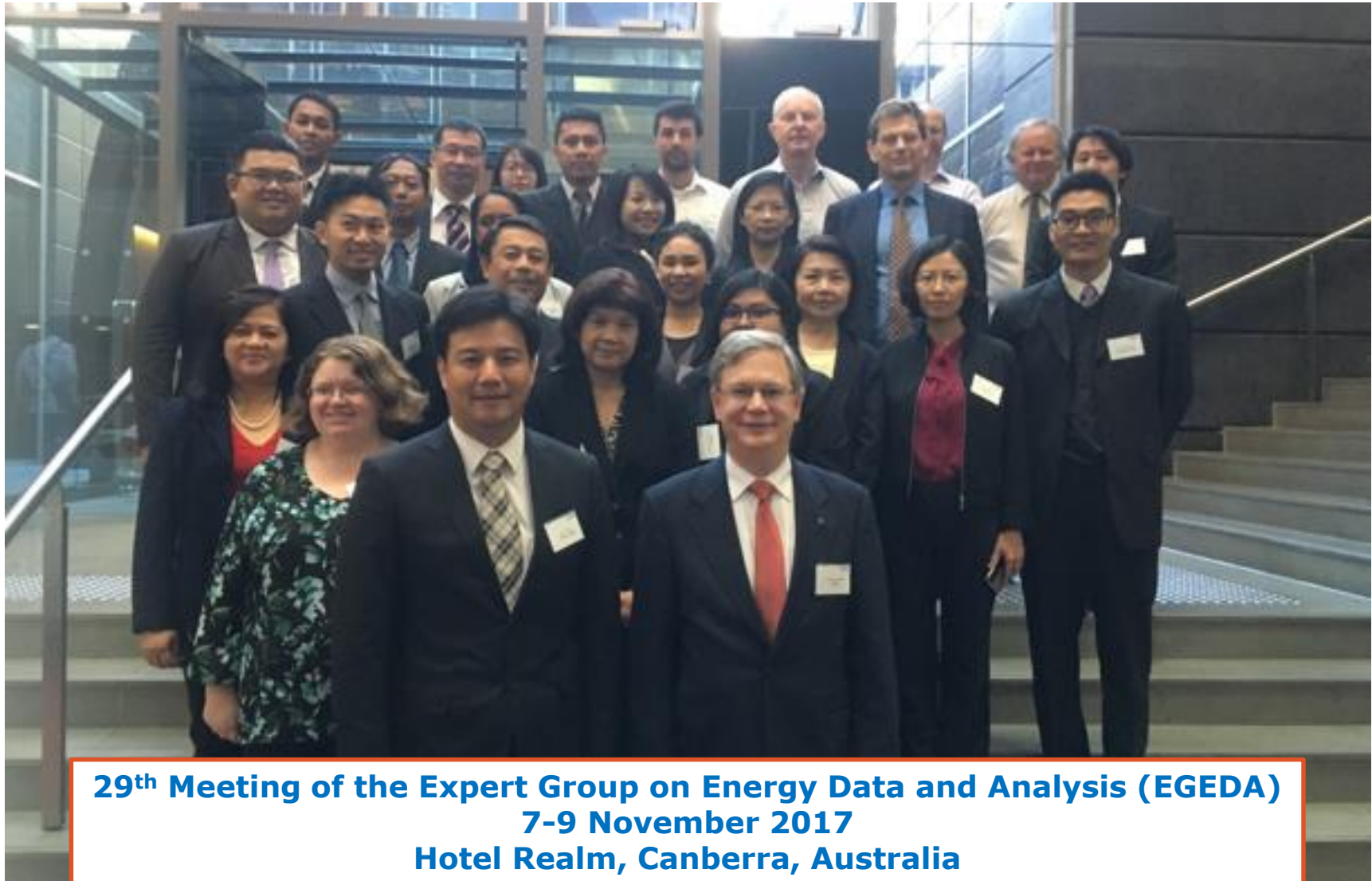
29 th Meeting of the Expert Group on Energy Data and Analysis (EGEDA) 7-9 November 2017 Hotel Realm, Canberra, Australia