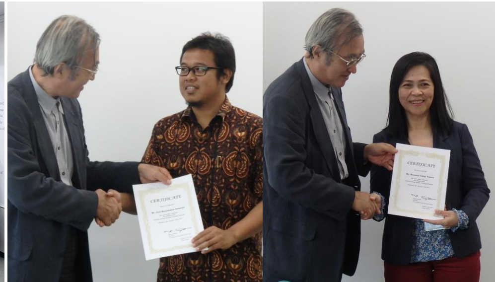
Middle-Term (8 weeks), 2017