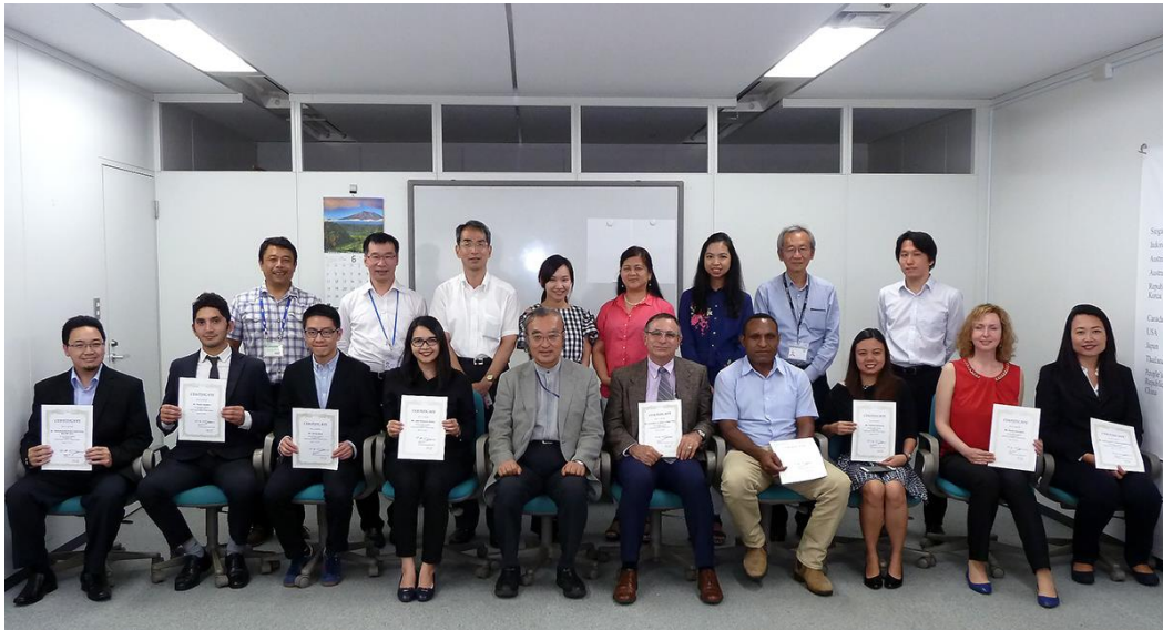
Short-Term (2 weeks), 2017