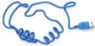
The New Handshake