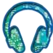
Electronics Fair (Autumn)