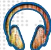
Electronics Fair (Spring)