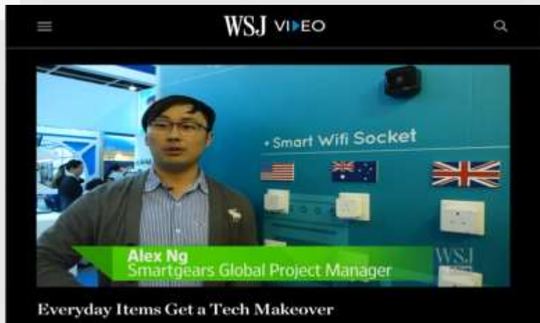
Electronics Fairs @ WSJ VIDEO