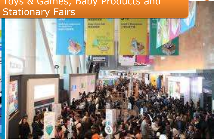
Toys & Games, Baby Products and Stationery Fairs