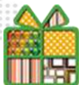
Gifts & Premium Fair