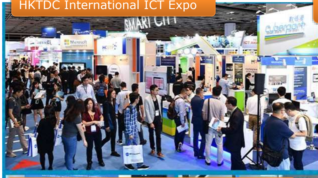
HKTDC International ICT Expo