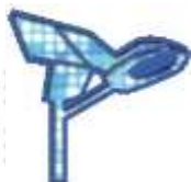
Outdoor & Tech Light Expo