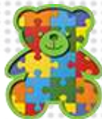
Toys & Games Fair