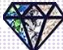
Diamond, Gem & Pearl Show