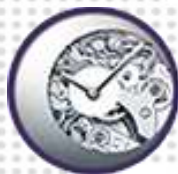
Watch & Clock Fair