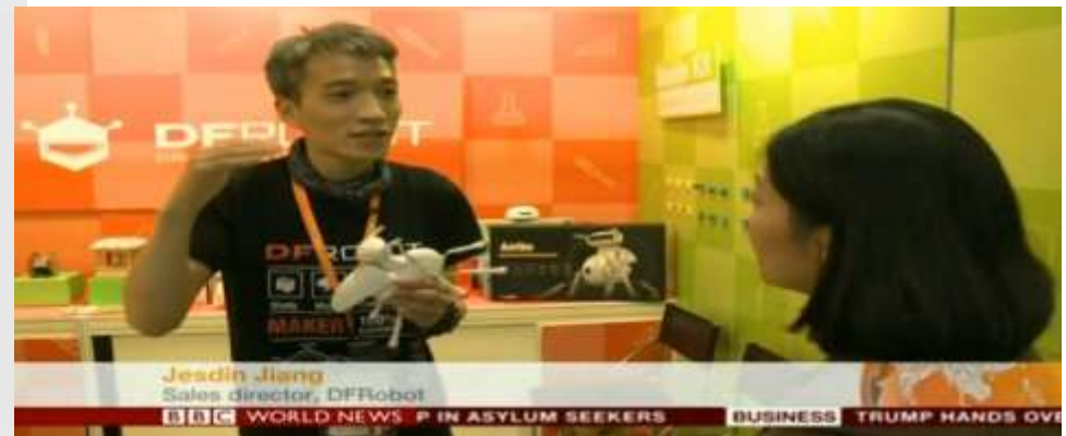
Toys & Games Fair @