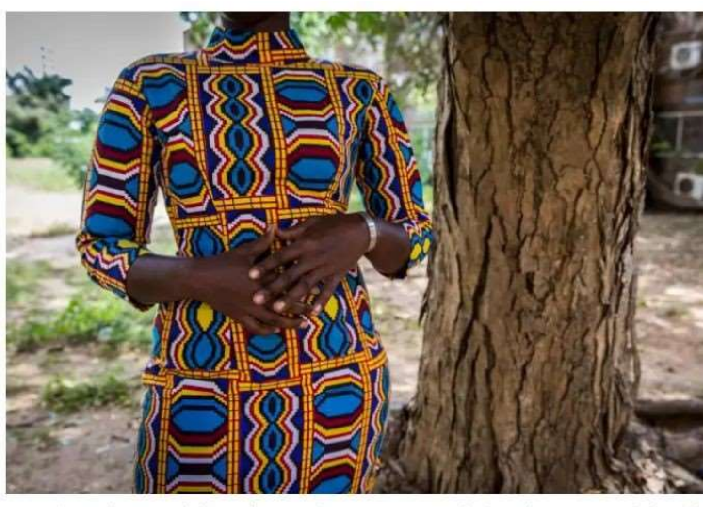
Marie (nom d'emprunt), l'une des nombreuses victimes de harcèlement sexuel dans le lycées sénégalaise, le 17 octobre 2018. Matteo Maillard

Sextorsion at school in exchange of good grades