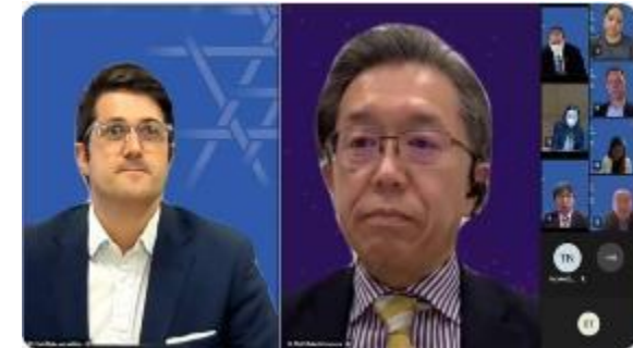
APEC Committee of Trade and Investment (CTI) Dedicated Session on FTAAP, 15 March, Virtual