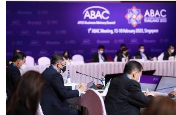
ABAC-SOM Dialogue during ABAC I Meeting for 2022, 16 February, Singapore