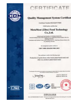
ISO9001 Quality management system certification