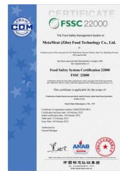
FSSC22000 Food safety system certification