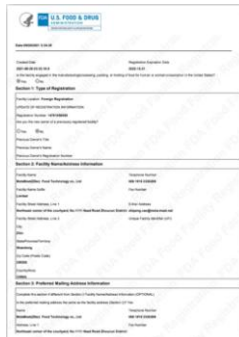
FDA food registration certificate