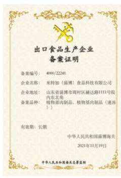
Record of export food production enterprises