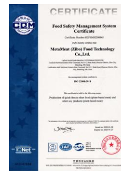
ISO2200 Food safety management system certification