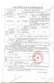
Food production license