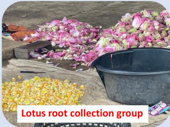
Lotus root collection group