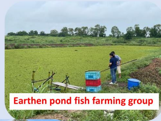
Earthen pond fish farming group