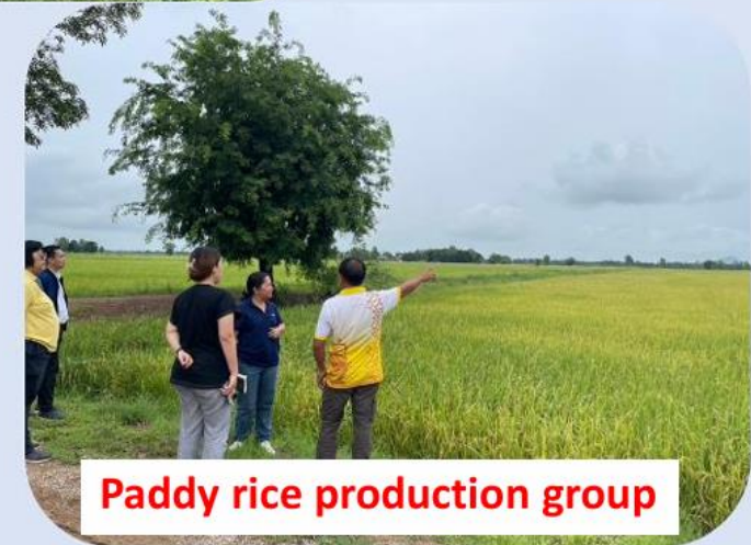
Paddy rice production group