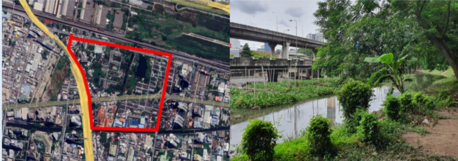
Makkasan Zone C Departure Park, Bangkok