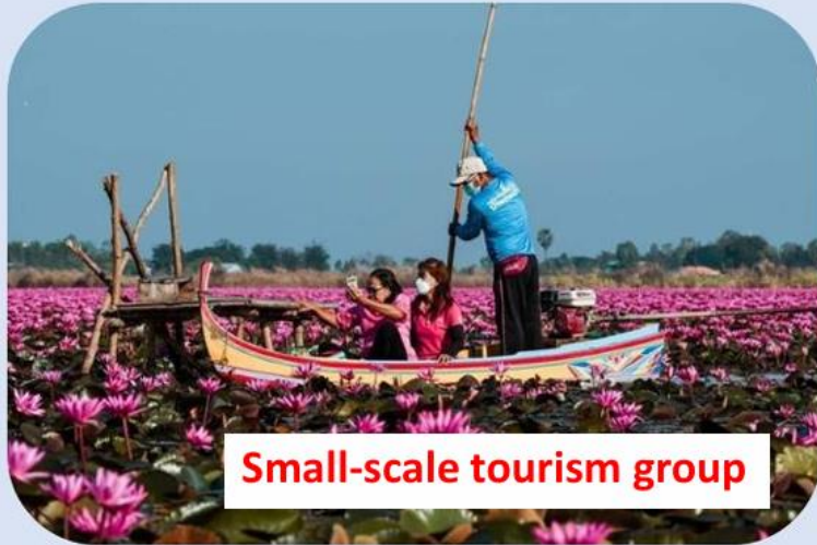
Small-scale tourism group