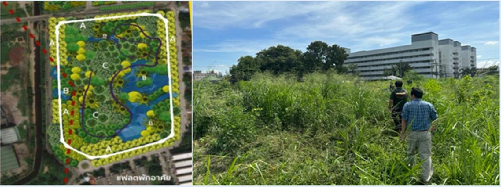
On Nut Urban Forest Park, Bangkok