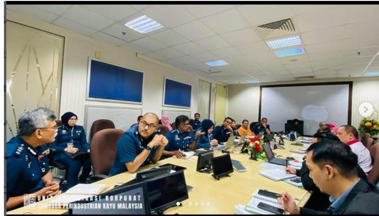
Regular Meeting between RMCD and Malaysian Timber Board (MTIB)