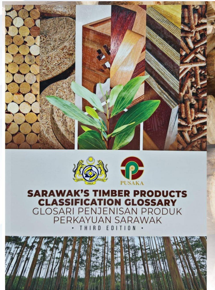
Book – Timber Products Classification Glossary 3 rd Edition